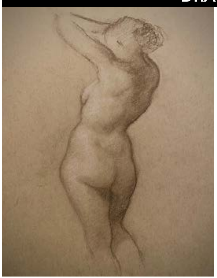
Figure Drawing Instructor: Scott Meir