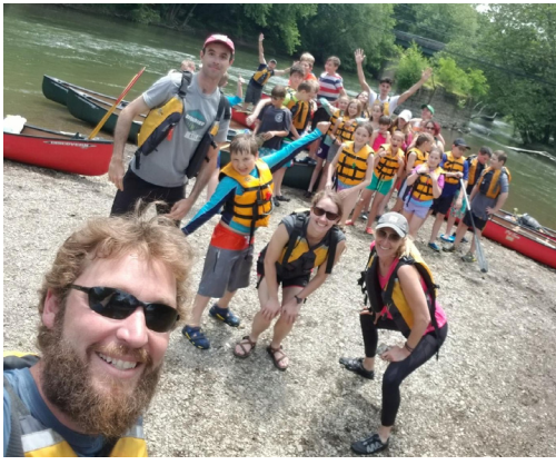
Dance Me a Story Camp for pre-schoolers with CPYB June 8-12 9 am-12 pm

'Art & Adventure' Camps at Diakon Wilderness Center