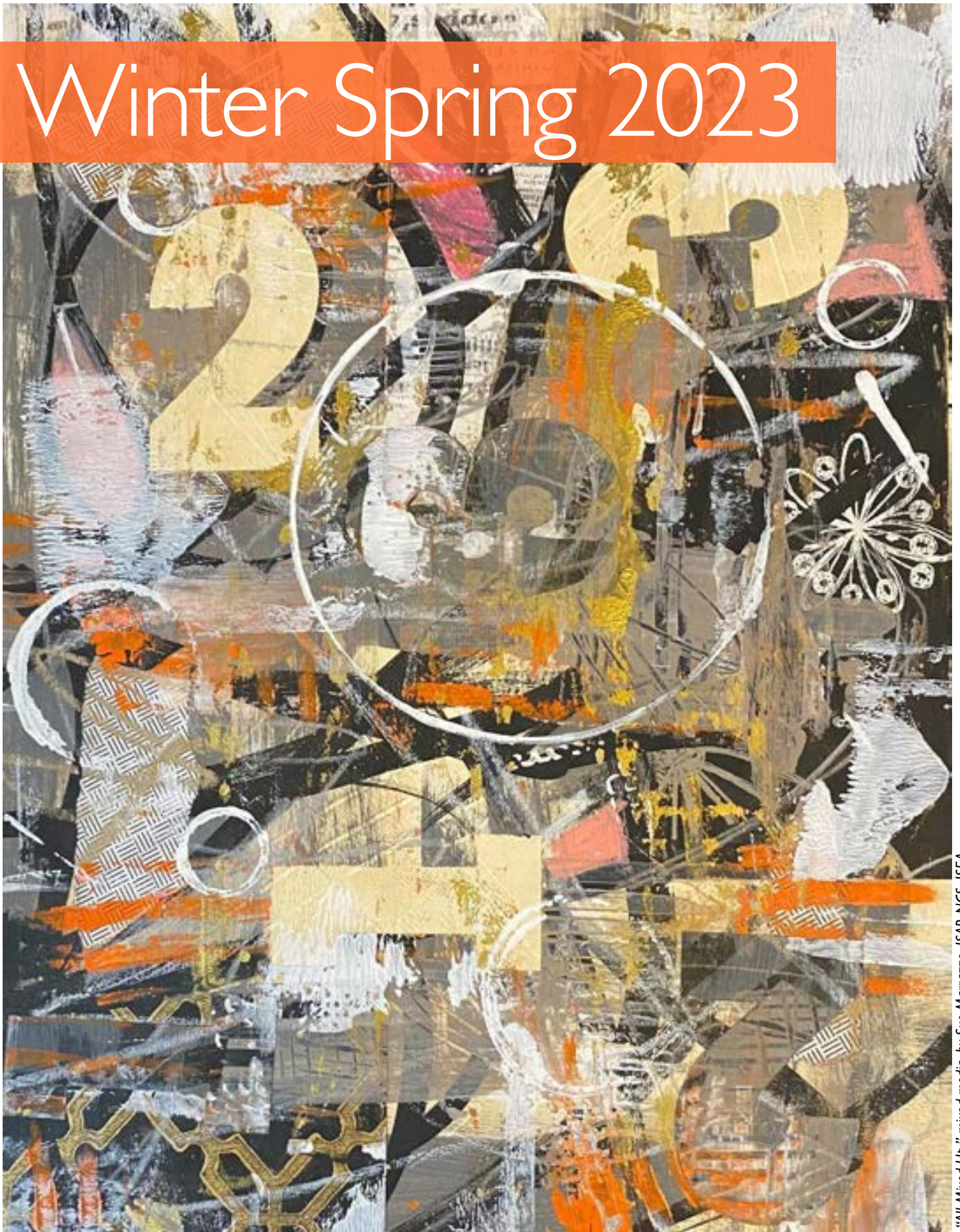
"All Mixed Up," mixed media, by Sue Marrasso, ISAP, NCS, ISEA